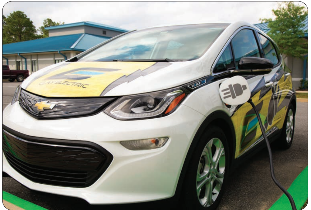
The Chevy Bolt EV pictured above is one of 14 vehicles that still qualify for a tax credit in the United States.

To be eligible for the full tax credit, the EVs must be made in North America