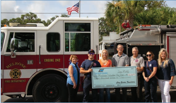
The Melrose Volunteer Fire Department received a grant from the Clay Electric Foundation.