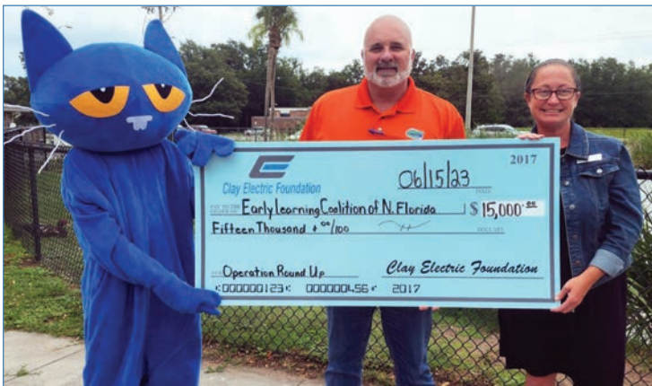
Early Learning Coalition of North Florida received a $15,000 grant.

For more information about the Clay Electric Foundation, or to apply for a grant, visit ClayElectric.com/operation-round