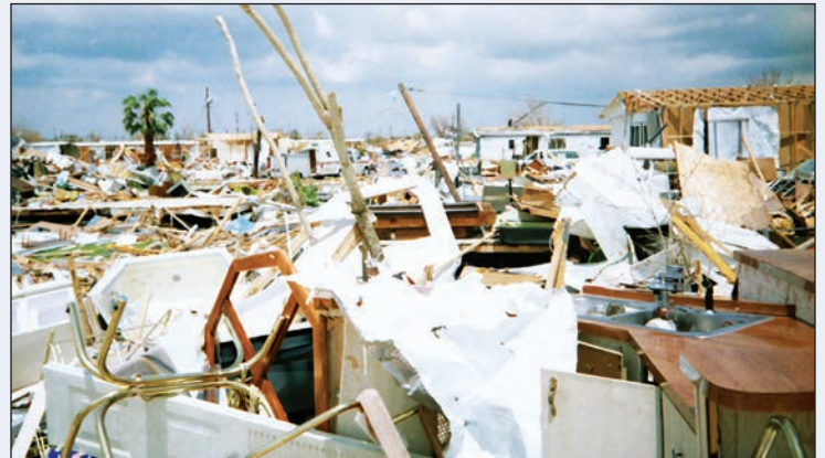
Archive photo from 1992 shows damage left in wake of Hurricane Andrew.

Your cooperative has stressed the importance of having a plan in place before a storm and having enough perishable food, water and other supplies. We’ve also encouraged understanding how to properly and safely operate a gas generator, which comes in handy should you experience an outage.