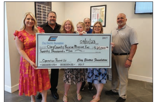
The Clay County Rescue Mission received a $20,000 grant from Operation Round Up in the month of August.