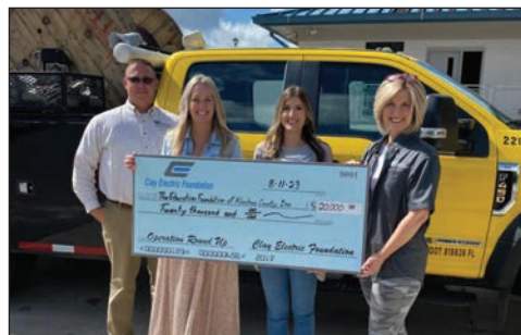
In August, $20,000 in grant funds were presented to the Education Foundation of Alachua County.