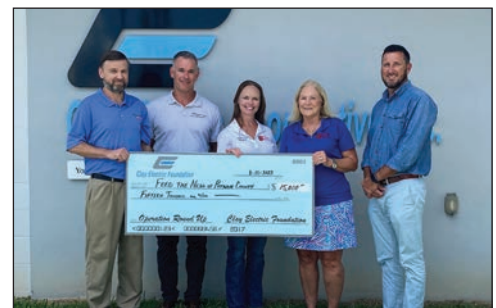
Feed The Need of Putnam County in August received $15,000 in grant funds thanks to Operation Round Up.