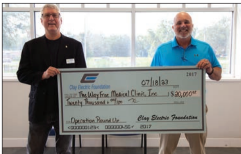
The Way Free Medical Clinic, which provides thousands of medical treatments to uninsured and low-income residents in Clay County, received a $20,000 grant.