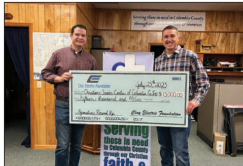
Through Operation Round Up, a $15,000 check was presented to the Christian Service Center of Columbia County in July.