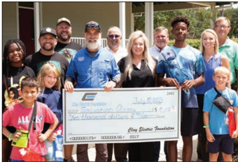
In July, $10,000 in grand funds helped send about 50 children to summer camp at Camp Keystone.

The Florahome Park & Heritage Association exists to serve the Florahome community through the care and enhancement of its historic neighborhood park. Grant funds will be applied to the restoration of the clubhouse exterior.