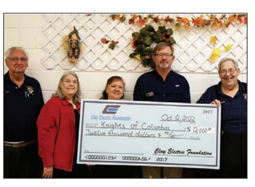
Knights of Columbus

people ages 5-21+ living with Autism Spectrum Disorder and other developmental disabilities through multidisciplinary therapeutic tennis instruction. Grant funds will support the Serving with HEART program in Gainesville.