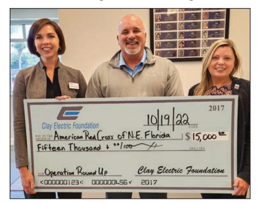
American Red Cross