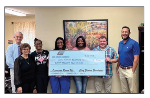
CDS Family and Behavioral Services, Inc.