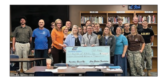
Friends of Keystone Heights High School