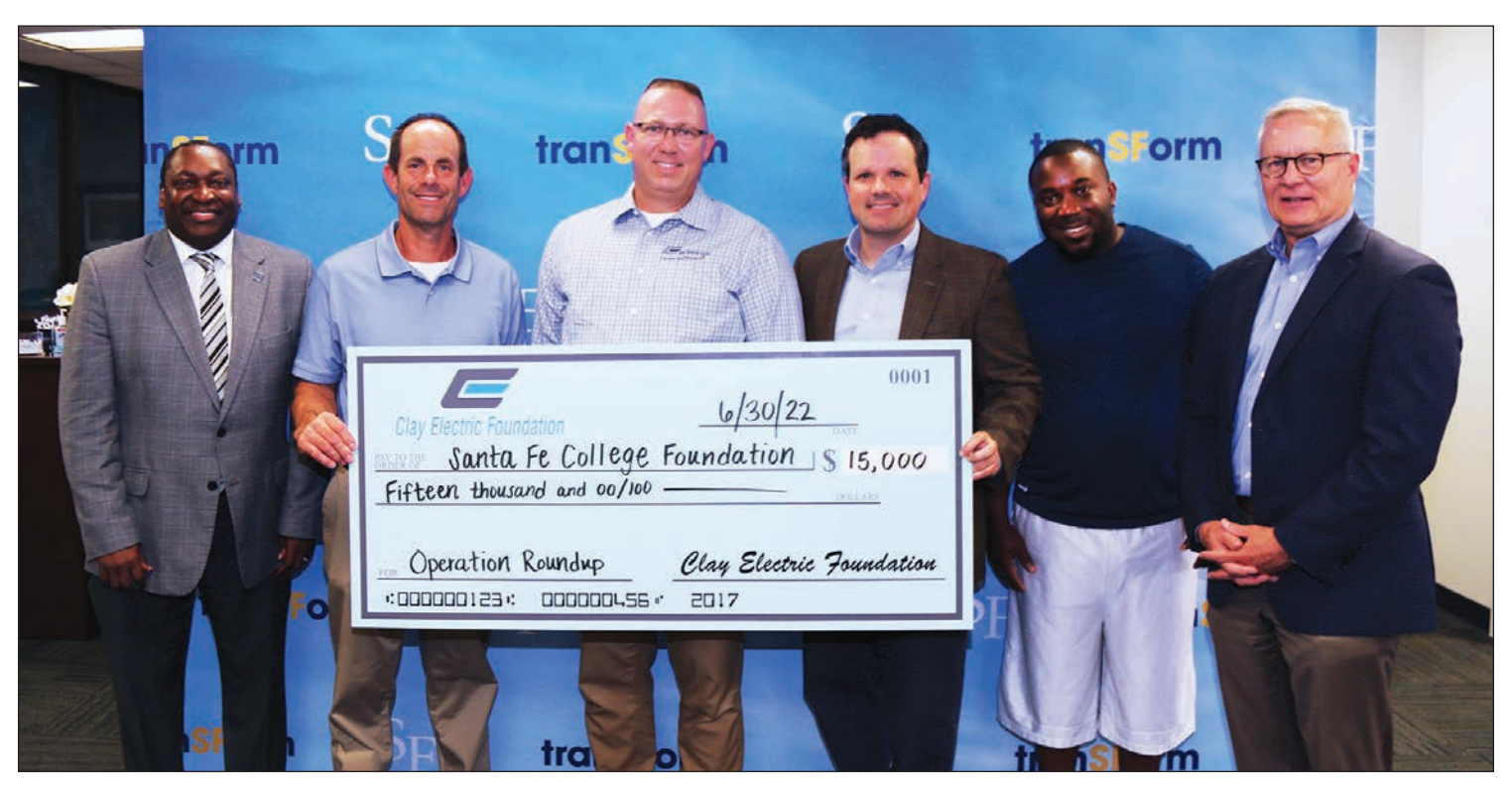
Santa Fe College Foundation