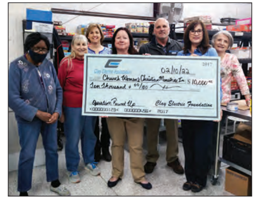
Church Women's Christian Ministries

The Union County Livestock Association is a new organization that serves youth and families through various agricultural programs and events. Grant funds will be used to obtain new swine pens.