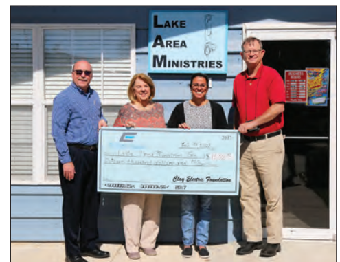
Lake Area Ministries