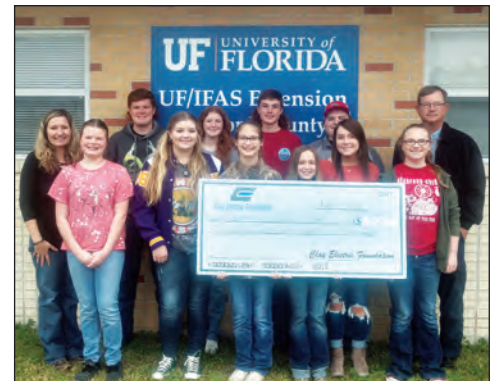
Bradford County 4-H