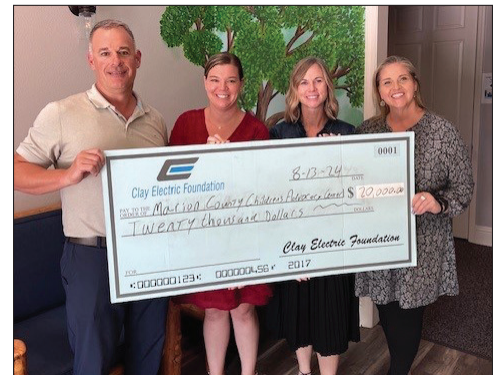
ORU granted $20,000 in funds to the Marion County Children's Advocacy Center.