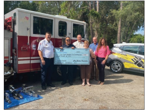
A $15,000 grant check went to the Cross Creek Volunteer Fire Department in 2024.