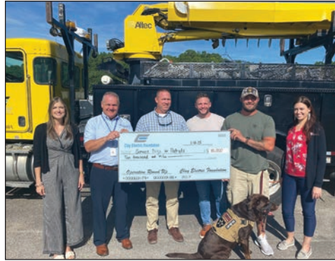
Service Dogs For Patriots previously received $10,000 in grant funds.

Founded in 1996 by Paul Newman and General H. Norman Schwarzkopf to make it possible for children with serious illnesses to enjoy a camp experience in a safe, medically-sound environment. Funds from the grant will be used to send campers to the camp's summer sessions.