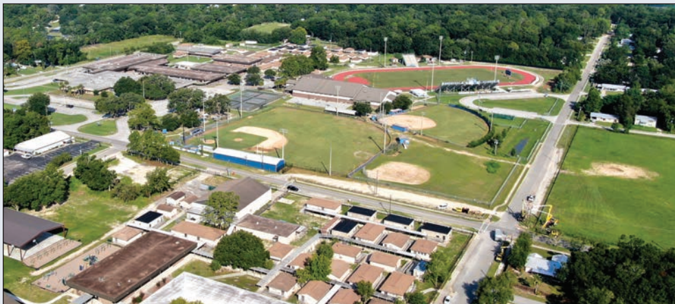
Drone photo shows Poncher's crew working in the impacted neighborhood.

A project that took us around the corner from our headquarters in Keystone Heights was designed to increase ampacity for members, improving reliability throughout the residential area along Orchid Avenue.