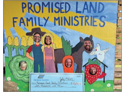
Promised Land Family ministries received $10,000 in grant funds this year.

Seeks to help women and their families during an unplanned pregnancy. Services are free and confidential. Funding from the grant will be applied to the purchase of a new ultrasound machine.