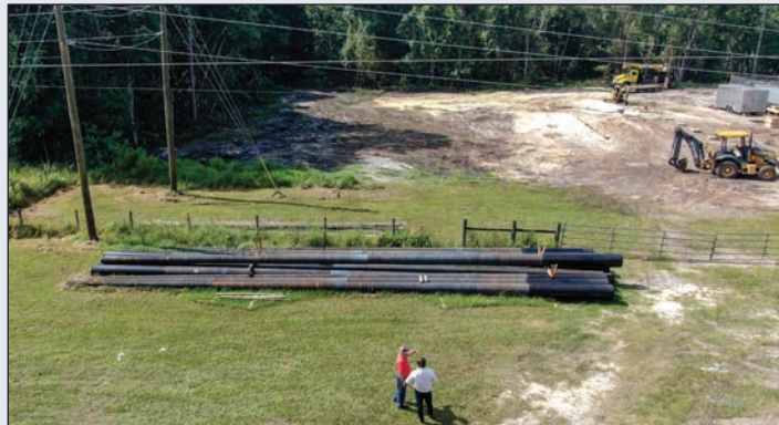
The new ductile iron poles await installation at the Georgetown Substation in Putnam County.

It's important to note that members who receive power from the affected substation should not notice an impact