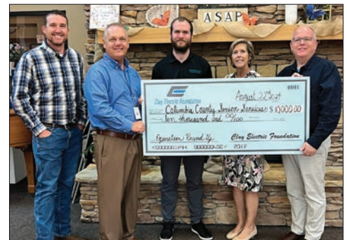
Columbia County Senior Services previously received $10,000.